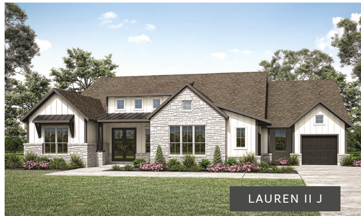
LAUREN II J

Illustrations show optional items and materials that vary based on availability and community requirements.