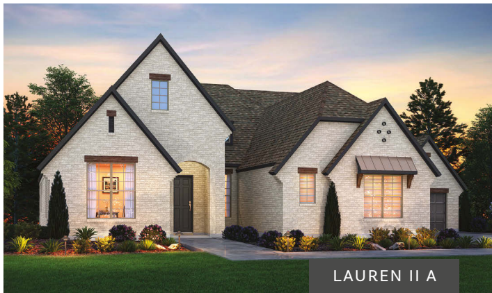
LAUREN II A