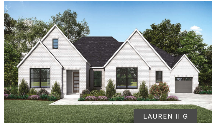
LAUREN II G