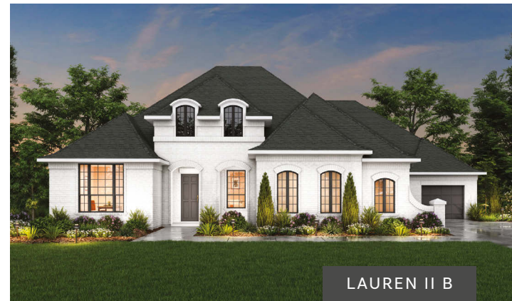
LAUREN II B