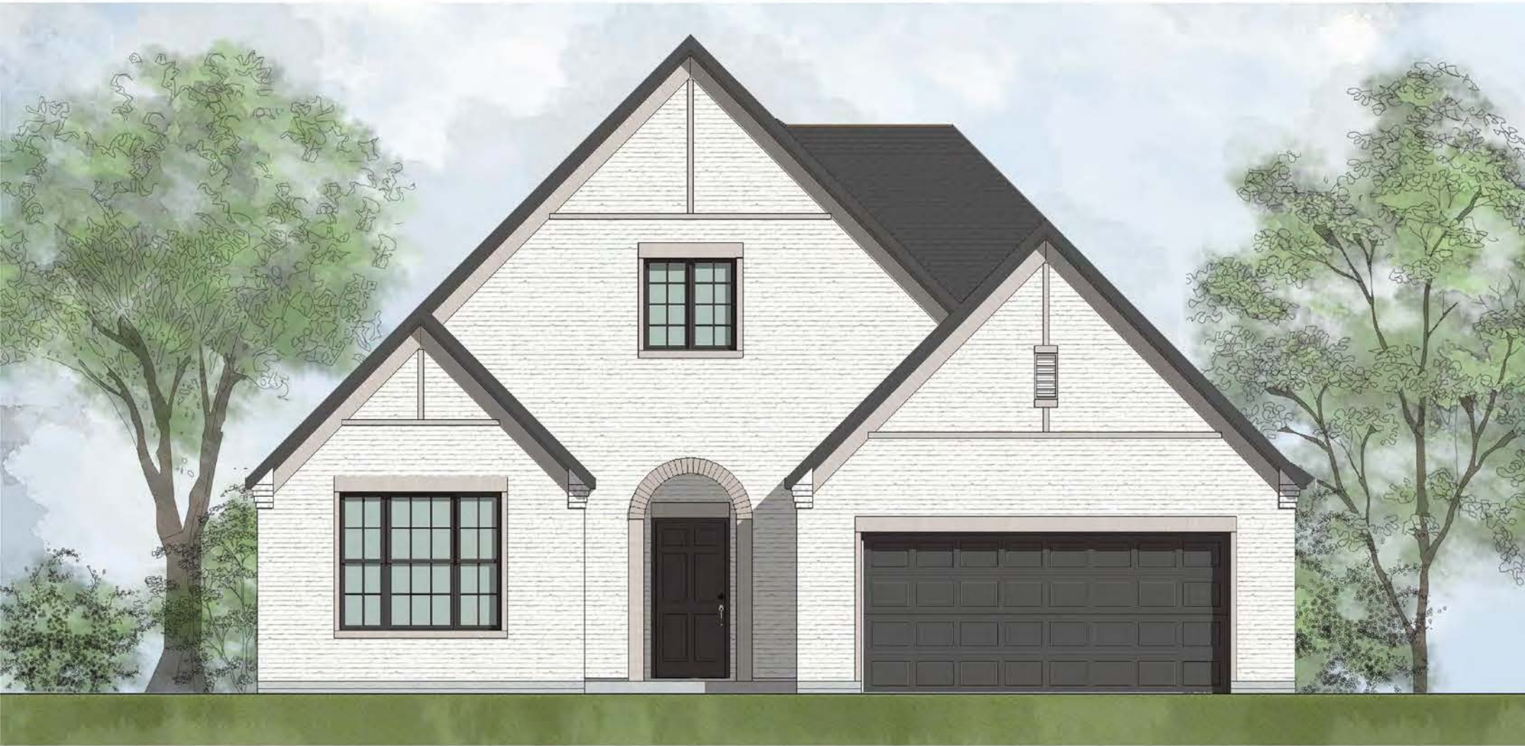
Huntley II B

The elevations and floor plans in this brochure show optional items.