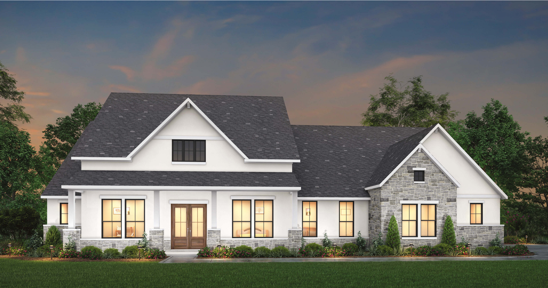
Julian IV E

Illustrations show optional items and materials that vary based on availability and community requirements.